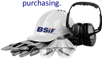
Safe Supply Course and Accreditation